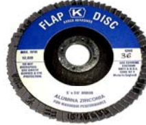
Flap disc with 7/8" arbor hole