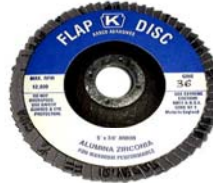
Flap disc with 7/8" arbor hole