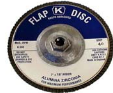
Flap disc with 5/8-11 threaded arbor