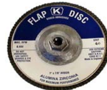
Flap disc with 5/8-11 threaded arbor