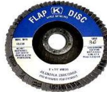
Flap disc with 7/8" arbor hole