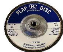
Flap disc with 5/8-11 threaded arbor